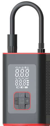
Intelligent Touch Screen inflator pump