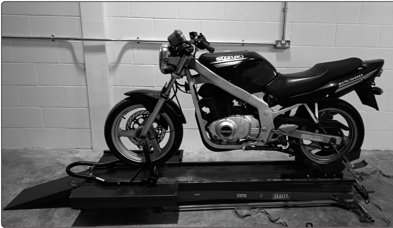
MC550SA in use with front paddock stand

NOTE: Motorcycle still needs to be tied down to the motorcycle lift.