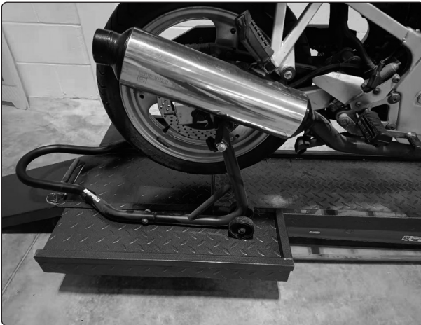
MC550SA in use with rear paddock stand.

NOTE: Motorcycle still needs to be tied down to the motorcycle lift.